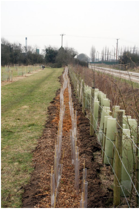
Manor Park hedge 2013

Another big activity will be “laying” 300 metres of hedge around Manor Park Field. HICOP’s Dan Mace says, “We planted this hedgerow in 2013. Eight years on it has grown up brilliantly, but that means the lower part is thinning out. An expert hedge-