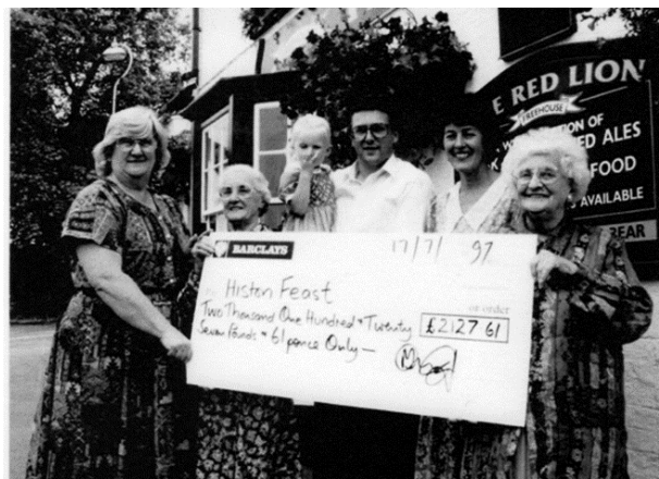
Red Lion Raising Funds in 1997 during The Beer Festival

The Histon and Impington Village Society's "Then and Now" section on its Facebook page has proved extremely popular this year, depicting how our villages have changed over the years. As a result, the Society are now asking for villagers to share their favourite memories of our community. Be they scenes, teams, or events, the only criteria are that they must be part of Histon and Impington's history. The society can work with hard or soft copies and will of course return originals where requested. We only ask that we can copy them and retain the copy in the Society's Archives with permission to use them for historical purposes. Further information can be obtained on our website or email.