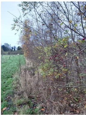
Manor Park hedge 2021