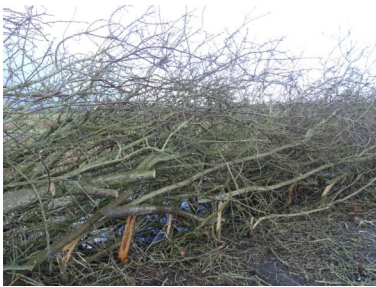
Example of an expertly laid hedge

layer will cut into some of the stems and lay them horizontal, so that the hedge thickens up and provides dense, safe habitat for birds and insects. We’ll be doing this work in early December.