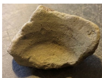
The base of a Roman Greyware drinking vessel, 1 st - 2 nd century AD, Manor Farm, Impington, found through field walking, December 2019