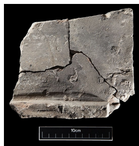
2 nd -4 th century AD Roman Roof Tile, Histon Manor

It has long been thought that the Histon Manor site and its environs is likely to have been at the heart of very early local settlement, not just from the 12 th century. We were very pleased this autumn to be able to start Test Pit excavation with 40 volunteers - a large amount of pottery sherds were found plus a Roman roof tile. Could there be a Roman building nearby?! The dated pottery indicates settlement on or near this site in the late Bronze Age, the Roman period, then early Saxon and medieval periods - probably attracted by the combination of access to well drained fertile soil on raised ground with a nearby water supply. The apparent continuous settlement on and near this site and that of Abbey Farm, from at least early Saxon times, accounts for the relatively large village recorded in 1086 in the Domesday Book.