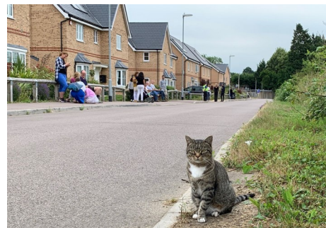
Residents waiting on Primrose Lane