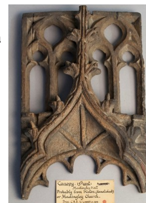
Remnant of 15 th C. Rood Screen, Cambridge Museum of Archaeology & Anthropology

Many will know of the earthworks on Abbey Farm outlining the demolished walls of the medieval church (St Etheldreda). We have been investigating the site with geophysics and aerial photography, and archive research. At the Museum of Archaeology and Anthropology is a fascinating piece of wooden sculpture, which the museum kindly brought out of deep store for us. It is a canopy head from a Rood Screen - most likely from the original St Etheldreda Church, whose chancel was still partly standing in 1728, but gone 30 years later. Some of the church was earlier recycled to Madingley Hall, and some can be found in the older houses of the village!