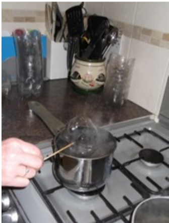
Shaping poppies with hot water

The WI Poppy Work continues to meet twice a month in order to make enough plastic poppies from recycled bottles to represent all local personnel who served, in whatever capacity. During Feast Week, residents will be given the opportunity to sponsor a poppy in aid of the ‘Royal Anglian Regiment Benevolent Fund’ and the mental health charity ‘Combat Stress’. Thank you again to all those who donated plastic bottles.