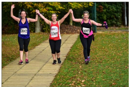
Bonfireburn 10k - 5.11.17 - www.bonfireburn10k.co.uk