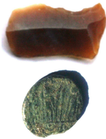
Flint knife blade and Roman coin

The final digging weekend on 6/7 August took our tally of test pits to 28 and revealed the original Anglo-Saxon locations of both Histon and Impington. It showed reduced arable cultivation after the Black Death and the embankment of the Impington Hall estate. We even found a Roman coin of 400-410 AD and a flint knife blade 5000-6000 years old!