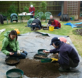
Digging, sieving and washing

Over 250 people were involved at some stage - a remarkable effort. Thanks to those who kindly hosted test pits and the impressive number of enthusiastic friends, relations and neighbours brave enough to come and try something a bit different.