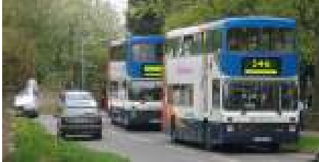
Buses parked in Burgoynes Road at the end of the school day - with traffic struggling to get past

Plans for this work have been passed, but we're waiting to know when the work will be started - keep in touch via the village website.