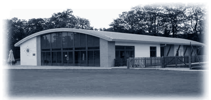
The Recreation Centre

Have you considered the excellent facilities available for hire at the Recreation Ground? It is available for children's parties, family functions, meetings, seminars, exhibitions, leisure class hire etc.