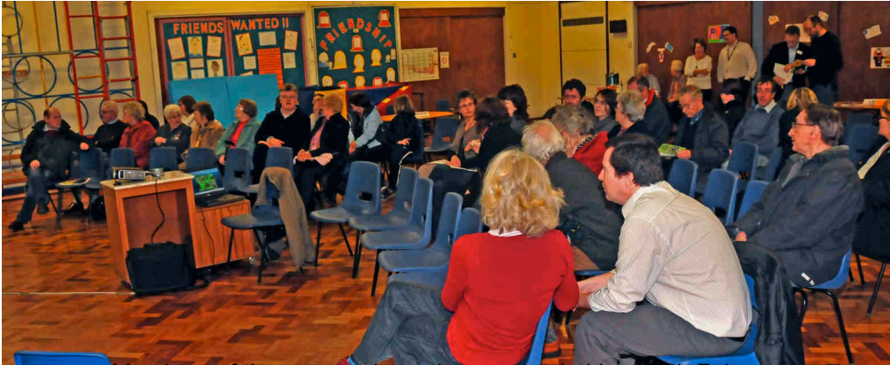
Members of the community at the meeting held on 25th February

Both Parish Councils have supported an initiative to review the provision of community facilities in our villages. As part of that consultation, a leaflet was prepared and should have been delivered by volunteers to every household. The leaflet explained the purpose of the exercise – seeing if there is a persuasive need for extra community facilities. Only if there was a compelling need would the parish Councils be asked to support a study into location(s), type of facility, and cost (both to provide and to operate).