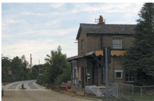
The guideway reached Histon Station, June 11

The Guided Bus continues to impact on our lives. Most of the road works are now complete, and the impact on businesses and residents alike is reducing. However, there will be short term